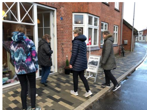
Strømpøhuset, Mælkevejen 1, 7990 Ø, Øster Assels, Denmark, during refurbishment and on the opening day of an exhibition.

For a photographic record of the refurbishment and information about the building's past and present, please see here .