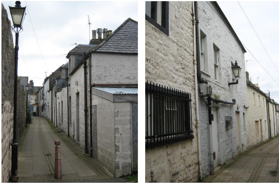
Cottages off Elgin High Street, Elgin, Northern Scotland, before (above) and after (below) regeneration.