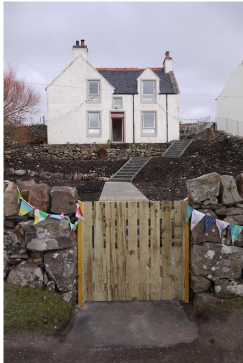
The old schoolhouse, Achiltibuie, Coigach, Northern Scotland, before (left) and after (right) transformation into two affordable homes.